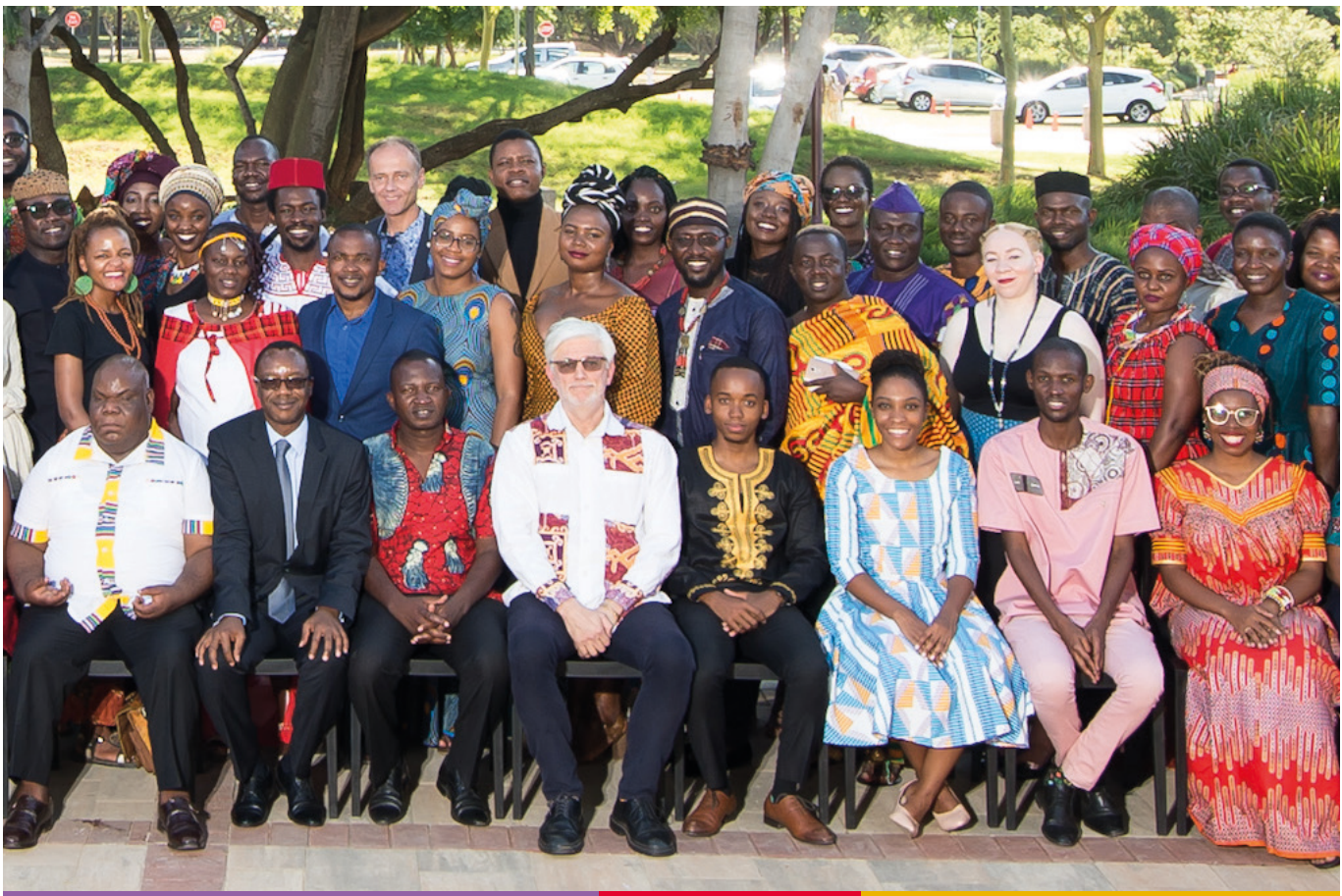
Master's Programmes Welcoming Ceremony 2019

In celebration of International Human Rights Day, the Centre for Human Rights , Faculty of Law, University of Pretoria, annually hosts its Master's Degree Graduation Ceremony on 10 December.